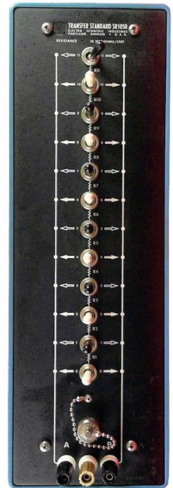
ORIGINAL ESI SR1050 DESIGN

Another area to look at is the common connector. ESI and Guildline both use a UHF Connector. Other manufacturers took the inexpensive route and put in a BNC connector. Does this really make a difference? The answer is not so obvious, however remember that this unit is rated up to 2500 Volts peak between any terminal and the case. A BNC connector (standard) has a maximum rating of 500 Volts. While some special higher voltage BNC connectors are available, the maximum rating is still only 1 kV, or about 1500 Volts short of providing safe operation. Safety and safe designs are one area not worth cost cutting features that can put operators at risk!